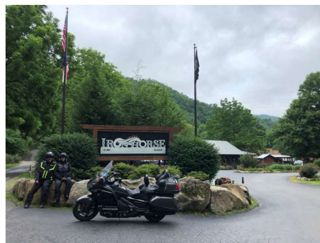
Iron Horse Lodge

that you prefer: private rooms, semi-private rooms, camping sites for tents and RV's. They have a nice dining room where they serve breakfast and dinner. Plus, they have a large outside area with tables, chairs, fire pit for socializing and on special dates they bring in live music.