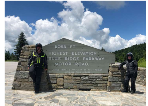
Blue Ridge Parkway

curvy climbing up the mountain to the Blue Ridge Parkway. Just beautiful!