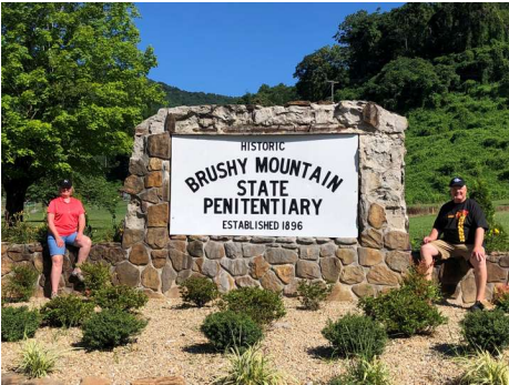
The Big House