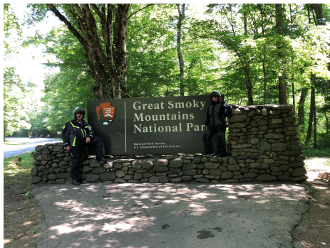
Smokey Mtn National Park