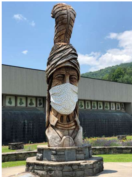
Sign of the Times

well, they're enjoying the park on this great holiday! Of course for us, it was a beautiful ride! Temperatures were comfortable that morning. We made it to Gatlinburg. Again, there were people, but nothing like the crowds we were expecting. We did a U-turn and retraced our route. We could tell traffic was starting to pick up as we rode back through the park to Cherokee. The temperatures were picking up too!