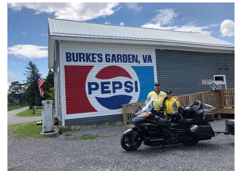
Popular Bonus Location