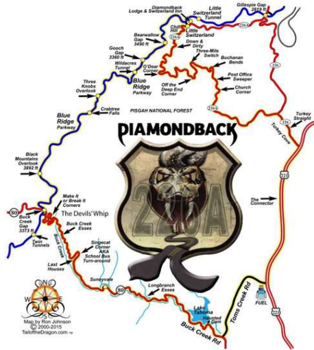
Little Switzerland, NC

Not only does the penitentiary offer tours, a gift shop and distillery, but also concerts are scheduled out in the yard.