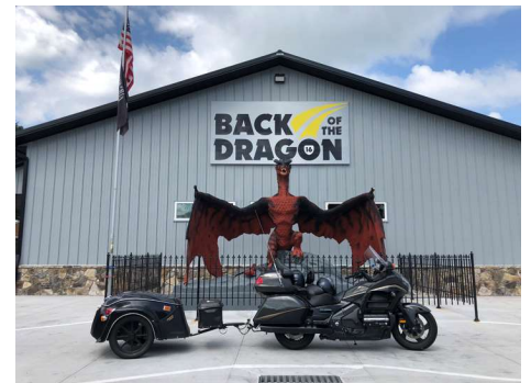
Visitors Center and Gift Shop

would enjoy VA 16 too. Once he returned, he began promoting the road and even had a meeting with the Governor of Virginia. That meeting provided him with a grant to promote tourism in the area and build the BOTD visitors center and gift shop. I'm sure tourism will grow in this area as it is a beautiful place with great roads to ride!