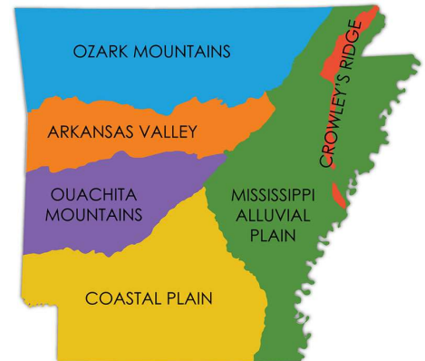
Regions of Arkansas

From West Memphis, it was 30 miles back to Hernando where I stopped at the local Waffle House for a meal and to chill out for a few minutes. Ever been to a Waffle House at 2:30 am? It's quite a bit different then 8:00 am! 'Nuff said!