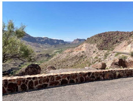
The River Road

the road and scenery were spectacular! I was riding next to the Rio Grande River in mountains and canyons on this curvy, hilly two-lane road! It was awesome! Unlike most roads, this was three-dimensional with the up and down hills along with the curves. And, these little hills would go straight – all you could see was the sky until you peaked the hill—then straight down! I loved it! Definitely one of my favorite roads! Highway 170 between Lajitas and Presidio is also known as “The River Road”!