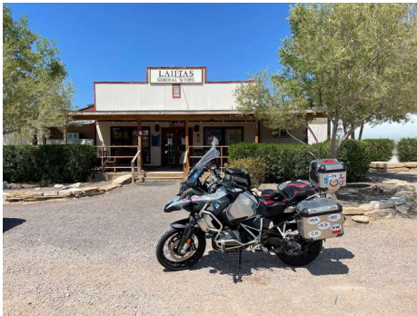
Lajitas General Store

Once through Big Bend, I rode through the town of Terlingua and on to Lajitas where a photo of my bike in front of the General Store was required.