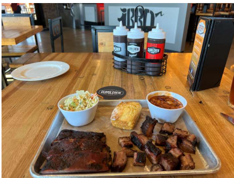
Ribs and Burnt Ends

I arrived as they opened at 11:00 am. I ordered the ribs and burnt end plate. It was amazing! Good choice, Mark!