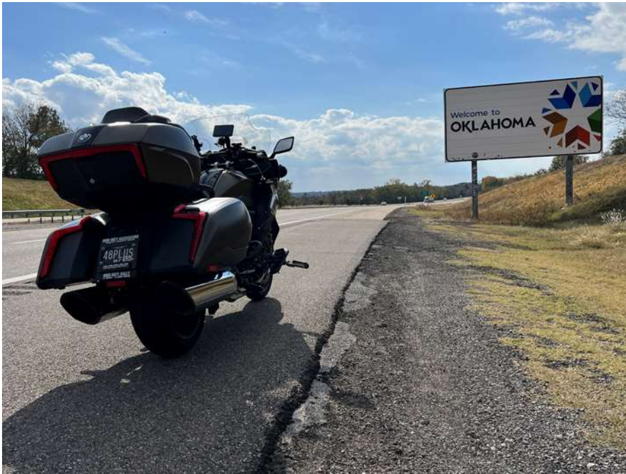
Oklahoma City Lunch Run