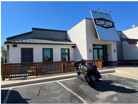
Clark Crew BBQ

My next stop was in Sallisaw about 20 miles into the state. It was 8:30 am. By now, I was thinking about lunch. I could cut out about 150 miles if I shorten my route to Oklahoma City. Hmm, I bet they've got some good BBQ! So, I GTS'd it (Google that stuff)! A couple sites listed Clark Crew BBQ. That's it! So, I entered it into my GPS and continued west!