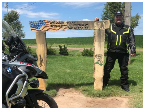
Center of the Lower 48

I finally make it to the small park dedicated to the geographical center. There is a small chapel (only big enough to seat 8 people), a stone memorial with flagpole, a stone marker, a bench and a sign.