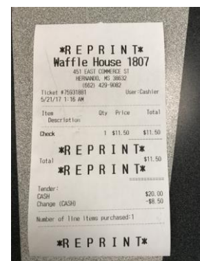
End Receipt: 1:16 am

Time: 1:16 am - An official time of 20 hrs, 15 minutes to complete all requirements of the EggSanity 1000! Now, we are Eggs-hausted! We exchange hugs and handshakes, then head to our own beds for a great night's sleep!