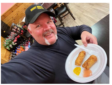
Egg Treat #3

Once through Nashville, I stopped in Murfreesboro for an eggroll at the "No. 1 Chinese Restaurant". I stopped for about 30-45 minutes to enjoy lunch. I had Mongolian beef along with 2 eggrolls. This stop got me re-energized to complete the ride! I had 400 miles to go!