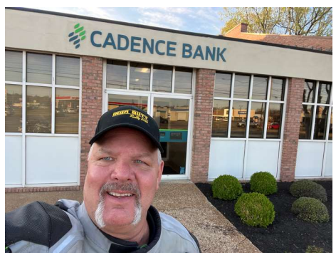
Nest Egg Requirement

of me—Blinding me at times as I rode along.