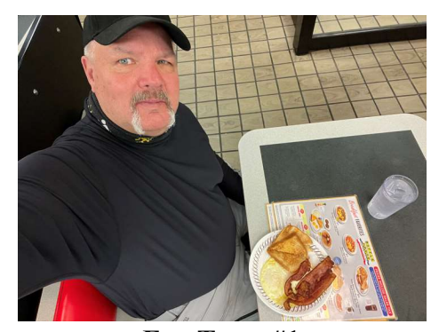
Egg Treat #1

My first stop was just down the street at Waffle House. I ordered a couple of eggs over easy, bacon and white toast. A perfect way to start the day! Before eating, I took the required selfie.