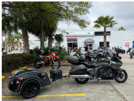
Ready to Head Home