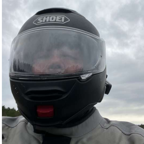
Rain Behind Me

Well, I woke-up at 4:30 am. Oh no! This is too early. I closed my eyes hoping to get another hour or two of sleep. I woke up again at 5:30 am. Then, I tossed and turned for a few minutes. I finally picked up my phone and looked at the weather. It said heavy rain and thunderstorms due in 35 minutes! That's all the motivation I needed to jump up and get on the road!