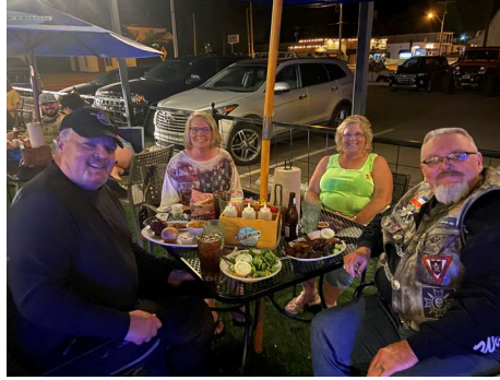
Uncle Bubba's in Hernando