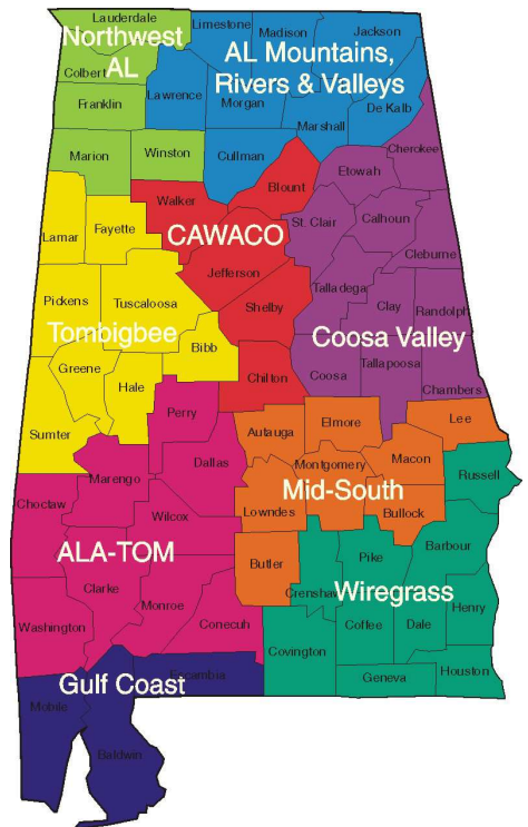
Areas of Alabama

they're a little more challenging than the typical 1,000-mile ride. The weather was nice! The scenery was awesome! It was a great day to ride around Alabama!